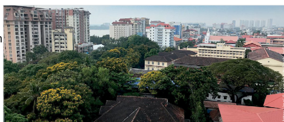
View over Kochi city