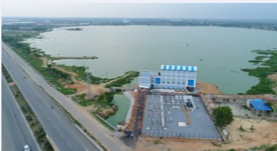
Narsapura lake filled with treated wastewater from KC Valley project in Bengaluru

The Sanitation and Capacity Building Platform (SCBP) at NIUA organised a consultation meeting— Mainstreaming Urban Sanitation in India on 10 December to present the research studies developed by its partners Biome Environmental Solutions Pvt-India and Indian Institute of Technology Roorkee. The purpose of the meeting was to insights on urban sanitation with the sector experts. The two research studies: Practice of Sustainable Urban Sanitation: Learnings from 9 Cities , and Characterisation of Dewatered and Dried Sludge from STPs and FSTPs highlighted the need for an adaptive management framework for sanitation, and the need to focus on heavy metal concentration in FSS management, respectively. The outcome of the meeting is to dovetail the learnings from these studies into the national urban priorities.